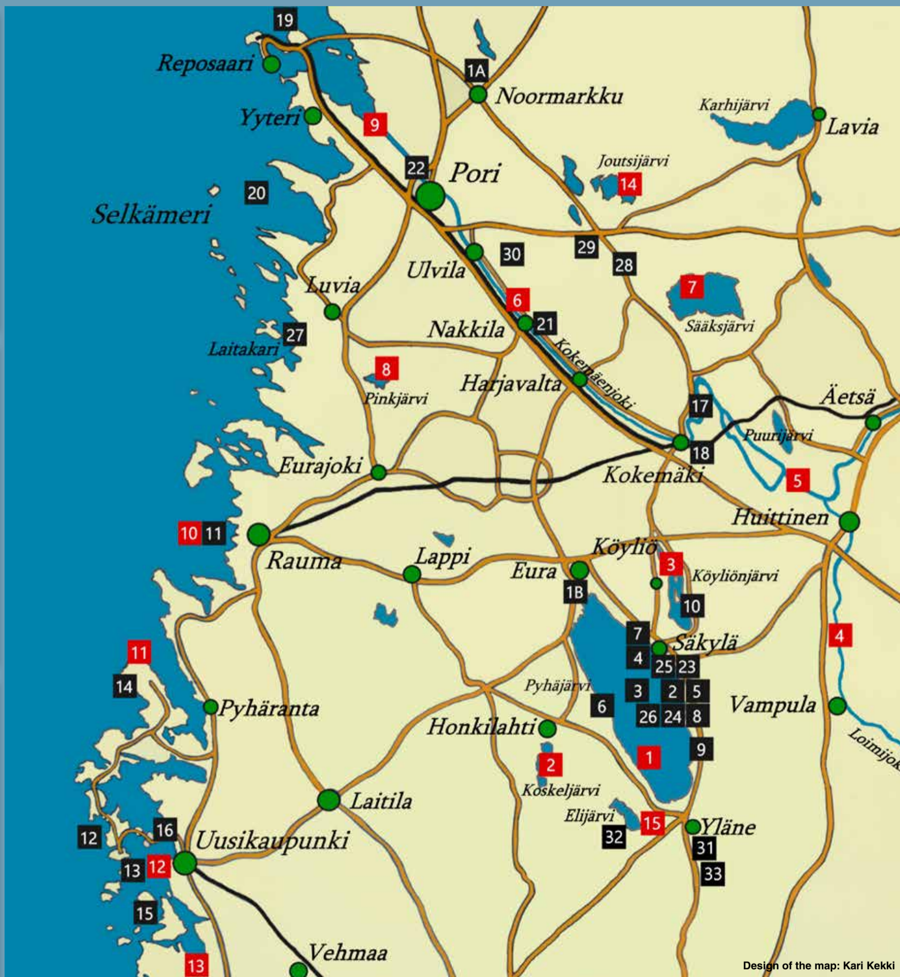
Design of the map: Kari Kekki

Elijärvi in Pöytyä, Yläne near the south-west corner of lake Pyhäjärvi is a shallow and humic lake. It covers an area of approximately 495 hectares and its depth varies from 1.4 to 2.4 metres. Elijärvi belongs to the Laajoki river basin and is its headwater lake.